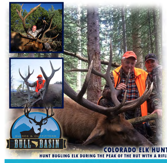
COLORADO ELK HUNT HUNT BUGLING ELK DURING THE PEAK OF THE RUT WITH A RIFLE

Each day the guides and clients are transported by UTV or 4 wheel drive vehicles to their exclusive hunting area on the ranch, which allows them the opportunity to plan out their hunts knowing that the area is available for their use only. The hunt includes lodging, meals and 2 on 1 guide. Hunt does not include: Transportation to/from ranch, meat processing, taxidermy, hunting gear, hunting license and stamps or tips. 2025 Season Donated by: Bull Basin Outfitters