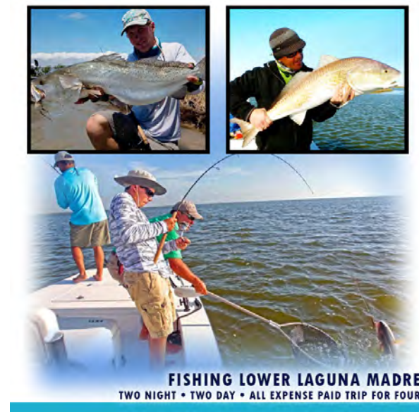
FISHING LOWER LAGUNA MADRE TWO NIGHT • TWO DAY • ALL EXPENSE PAID TRIP FOR FOUR