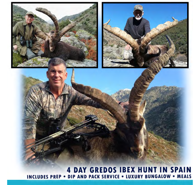
4 DAY GREDOS IBEX HUNT IN SPAIN INCLUDES PREP • DIP AND PACK SERVICE • LUXURY BUNGALOW • MEALS