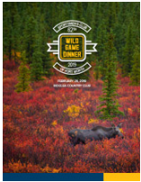
2019 SCFW Dinner Program