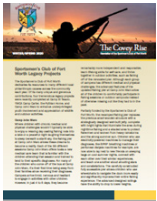
2020 SCFW Newsletter